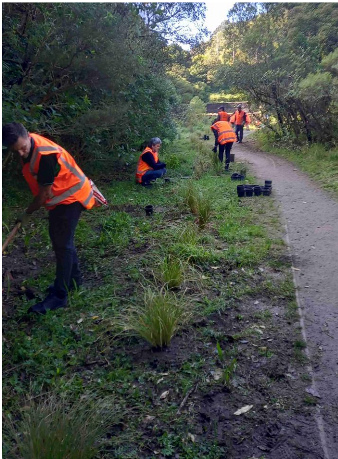
Planting upstream of the magazine ruin