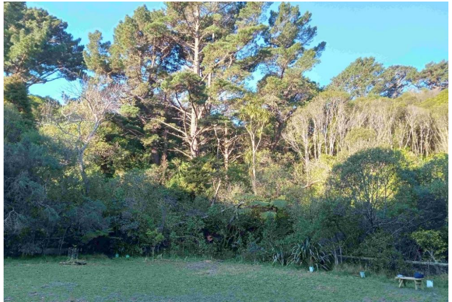
The cut willow stump in the photo at left is in the middle of the above photo, up from the Wightwick's Field grass.