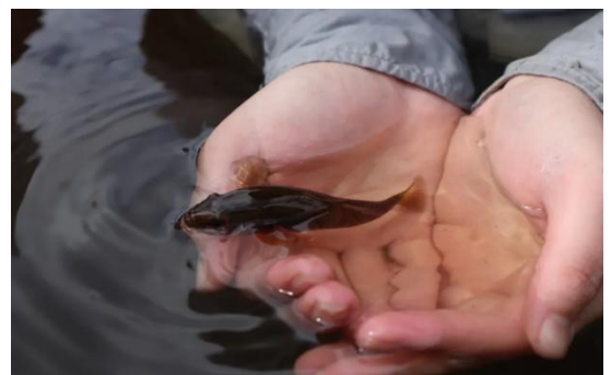
at release 2023

Further upstream, whakaweku (bundles of dried bracken fern) have been installed at the outflow of Appleton Park to help conservationists monitor for toitoi. These native fish have quickly spread from their translocation site at the upper Zealandia reservoir downstream into Birdwood Reserve. Currently, we're unsure whether toitoi can survive past the Appleton Park tunnel, so we're working with our neighbours to find out. Let's keep our fingers crossed we find some!