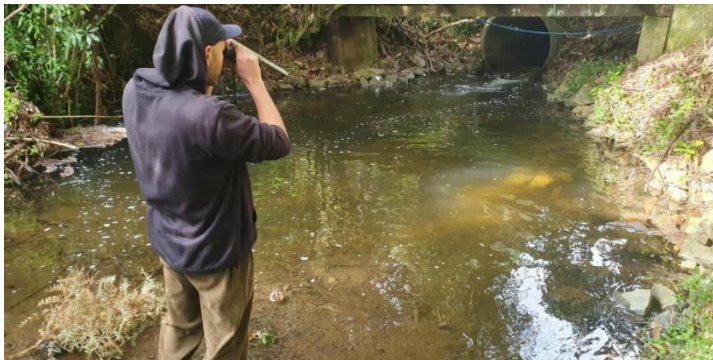
Looking for toitoi at entrance to Appleton Park culvert.