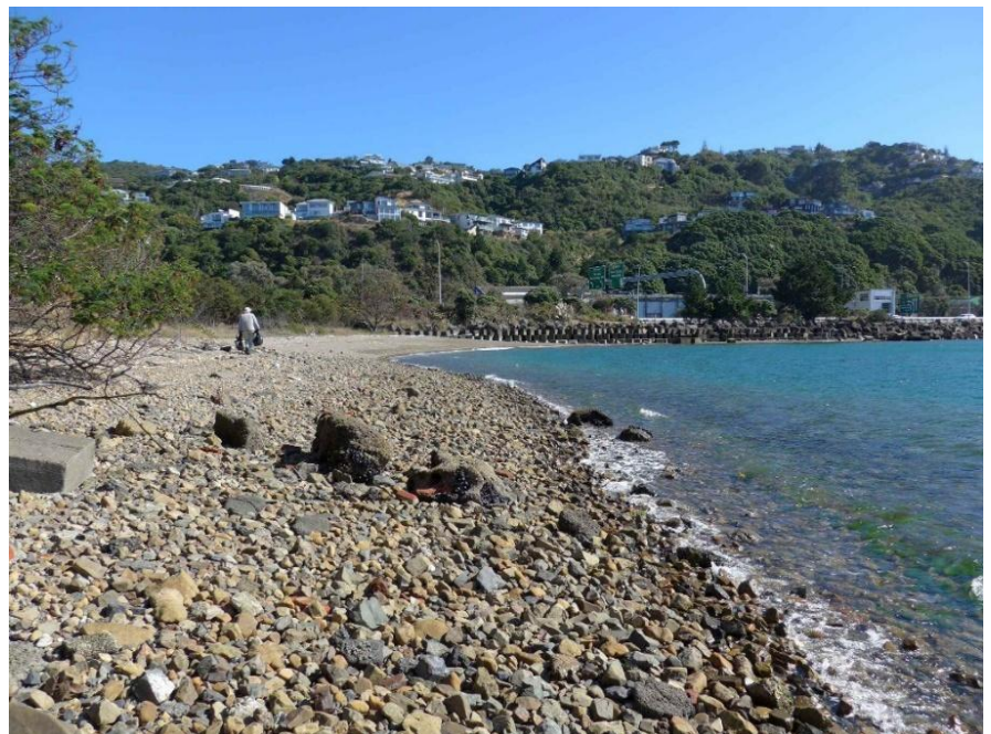
An inaccessible gem: the northern beach of the Kaiwharawhara reclamation.