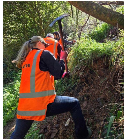
Clearing the slip

A big thank you to Mitre10 Crofton Downs for donating the wheelbarrow to TPG.